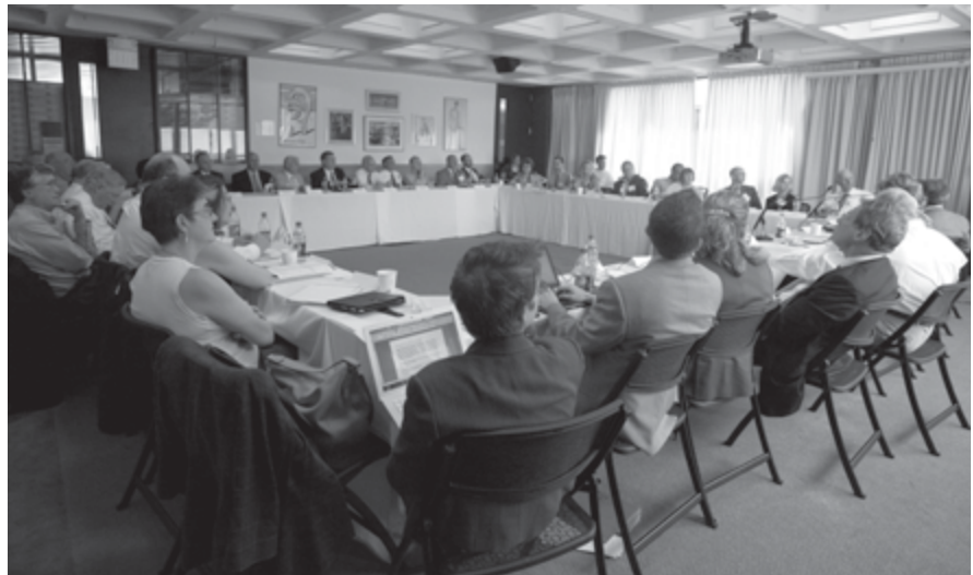
Members of the Pro Bono Task Force at their inaugural meeting

In 2009, the Indiana Supreme Court announced a campaign to train more than 700 Indiana judges, mediators, and lawyers on handling foreclosure cases. The Court offered scholarships to private attorneys for the training if they agreed to handle one mortgage foreclosure case on a pro bono basis.