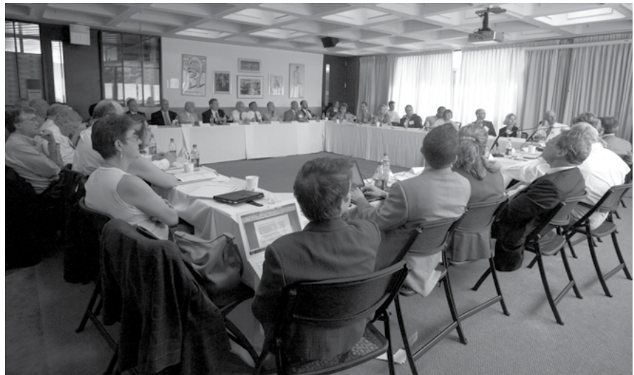
Members of the Pro Bono Task Force at their inaugural meeting

In 2009, the Indiana Supreme Court announced a campaign to train more than 700 Indiana judges, mediators, and lawyers on handling foreclosure cases. The Court offered scholarships to private attorneys for the training if they agreed to handle one mortgage foreclosure case on a pro bono basis.