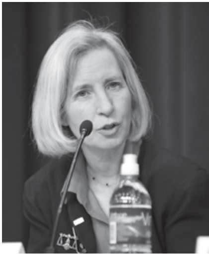
Martha Minow of Harvard Law School, Pro Bono Task Force Co-Chair