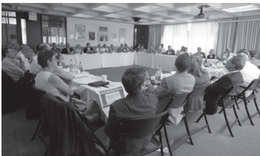
Members of the Pro Bono Task Force at their inaugural meeting

In 2009, the Indiana Supreme Court announced a campaign to train more than 700 Indiana judges, mediators, and lawyers on handling foreclosure cases. The Court offered scholarships to private attorneys for the training if they agreed to handle one mortgage foreclosure case on a pro bono basis.