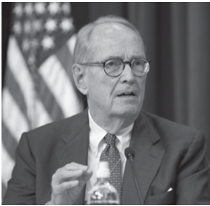
The Honorable Dick Thornburgh, former U.S. Attorney General and former Governor of Pennsylvania

To improve evaluation of pro bono activities by LSC-funded organizations, the Task Force recommends that LSC: